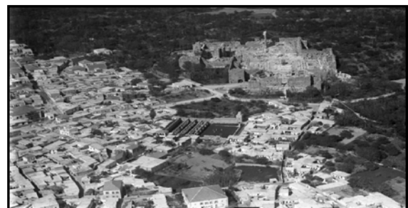
Figure 2. Baalbek's oblique image 1933

The focal length was considered (260) mm based on the informations which were noted on the images borders.