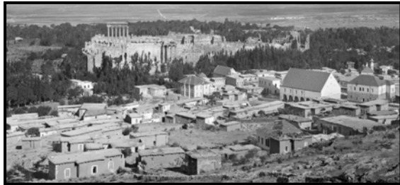
Figure 3. Baalbek's terrestrial image 1904

The third part of the Baalbek's images is the terrestrial images which refer to the first German researches in the beginning of the 20 th century AD (Fig. 3). These photos are stored in the regional authority of Brandenburg (Meydenbauer's archive). There are about 23 terrestrial images of Baalbek which were taken in the year 1904. The probable photograph distance was considered approx. 100 m. The resolution of the scanner used is 1000 dpi that leads to the pixel size about 25 μm (See Table 3).