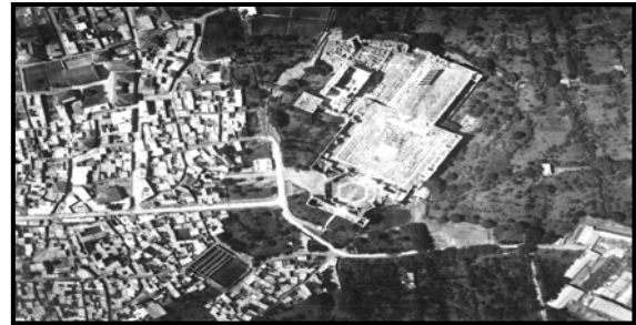
Figure 1. Baalbek's vertical image 1937

Therefore, the focal length of the camera used in the vertical photos was considered 200 mm in the bundle block adjustment depending on the glass sheet with the image size 18×13 cm.