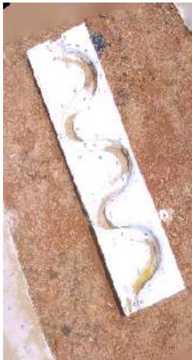
Figure 3. Mosaic Orthophoto.