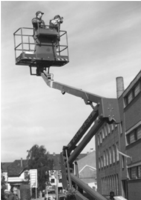
Figure 5: Image acquisition out of a stroke riser

Due to the limited space for the selection of image stations and due to the height of the buildings, numerous images have been taken from a stroke riser (Figure 5).