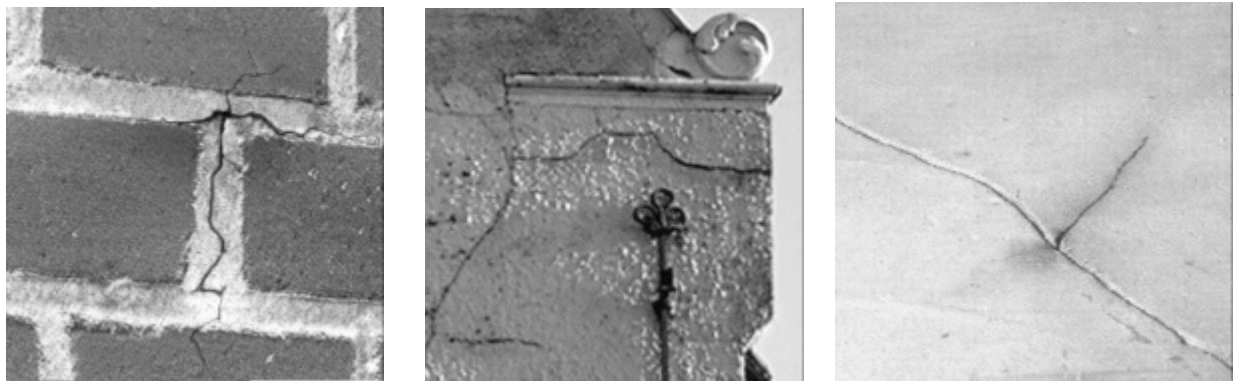
Figure 3: Documentation of existing damages

In order to avoid claims for damages without good reasons, the project leader has placed orders for extensive evidence control measurements. These should document the existing damages on buildings before any construction work has been started. This includes all visible damages on interior and exterior parts of the buildings, e.g. setting breaks or damages bricks of the walls. Each damage is then measured by special gauges or tools, and documented by photographs (example in Figure 3). This work has been carried out by legally authorised experts.