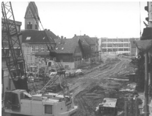
Figure 1: Construction site "Hemelingen Tunnel"

In the 1980ies plans have been initiated for a large inner-urban street tunnel in the city of Bremen, Germany. The designed "Hemelingen Tunnel" was mainly planned as a connection between the freeway and the car factory of Mercedes-Benz, and to ease the traffic load within parts of the city. The location route mainly passes older residential areas in need for redevelopment, and some industrial zones as well (total length of location route approx. 2.3km). The tunnel is currently built in an open ditch, i.e. without underground work. However, some adjacent building have to be pulled down in order to dig the ditch. After finishing of the tunnel construction work the area above ground will be rebuilt as redeveloped residential and recreation areas.