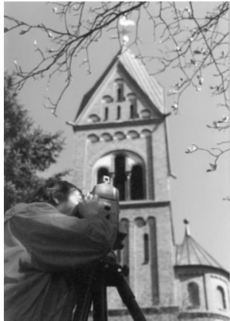
Figure 6: Angle measurement