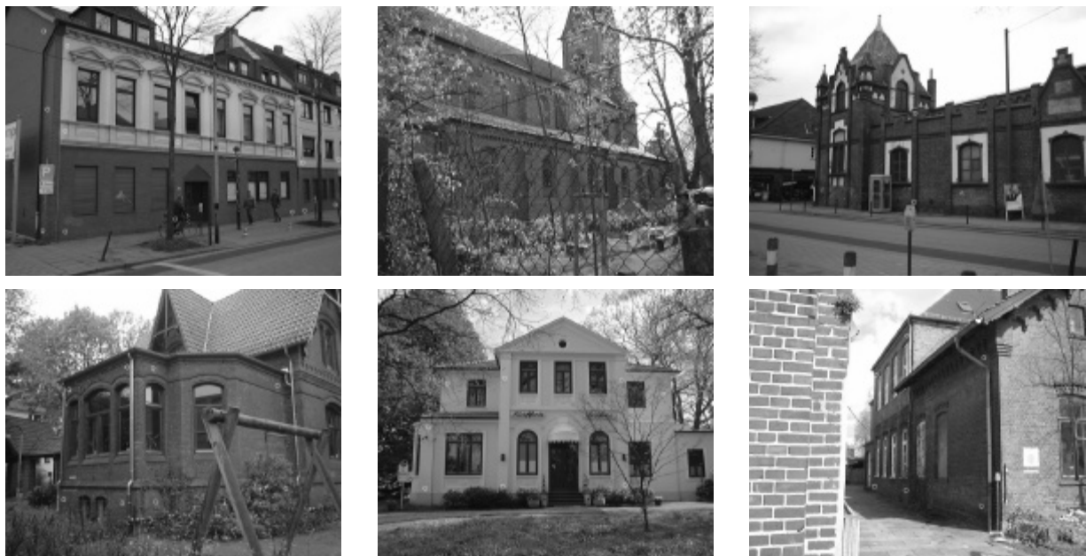
Figure 8: Examples of metric images

Definition of scale and datum of the object co-ordinate system was performed by precise leveling and geodetic angle measurements using an industrial theodolite measuring system based on precision theodolites Leica T2002 (Figure 6). Targeted precision scale bars (Brunson), again taken from an industrial metrology system, have been used to define reference distances in object space. As an example, Figure 7 shows the geodetic network of directions for the measurement of control points, and the configuration of photogrammetric tie points as well.