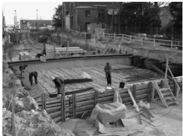
Figure 2: Construction work in open ditch