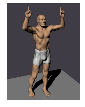
Figure 2: 3D model created with computer animation software. Left: 3D Studio Max [3], right: Lightwave [23].