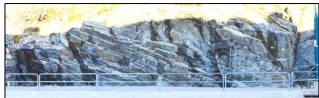
Figure 1. Mannsverk outcrop, 20m-wide, 3-m-high, North is to the left, the outcrop is facing West. The geological scan line was surveyed slightly above the hand rail, from this perspective.

FACETS was applied to a 3D point cloud of road section located in Mannsverk, a suburb east of the city Bergen, Norway (5.3683°E; 60.3571°N). The outcrop faces west with a crudely north-south trend. The rock is an “amphibolite, transformed and severely deformed gabbro and green stone with bands of trondhjemite” (NGU, 1/50.000 geological map). The outcrop is 20m long and 4m high.