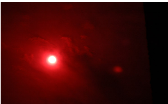
Figure 1 A sun's image

By this way we obtain many images like that illustrated in Fig.1. The sun's image at each of them is a good target at the right place on the camera's frame. The accurate exposure time of each of them, determined by the intervalometer, enable to determine the accurate values of the corresponding sun's declination and Greenwich Hour Angle.