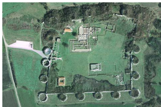
Figure 1. Archaeological site – Fortress

The experiment was performed on archaeological site of FELIX ROMULIANA near Gamzigrad (Serbia). Felix Romuliana in Gamzigrad is thought to have been one of the residences of the Roman Emperor Gaius Galerius Valerius Maximianus, built in the late 3rd and early 4th century (more data to be found at http://en.wikipedia.org/wiki/Gamzigrad ).